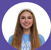
Trinity Festa Program Admin trinity.festa@uifpgh.org